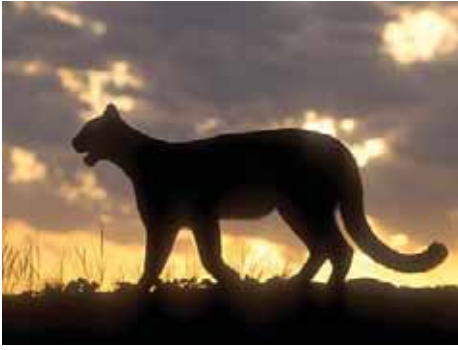
Mountain lions are solitary hunters that can measure eight feet in length from the tip of their nose to the tip of their tail. They are very efficient opportunistic predators with great athletic ability. They are stealth predators preferring to hunt at night making use of stalking cover to draw close to their prey. Weighing between 70 and 200 pounds, they have the agility of a small cat and the strength of a leopard. There are approximately 10,000 mountain lions living in Oregon and California and there are large breeding populations in many other states and Canada.