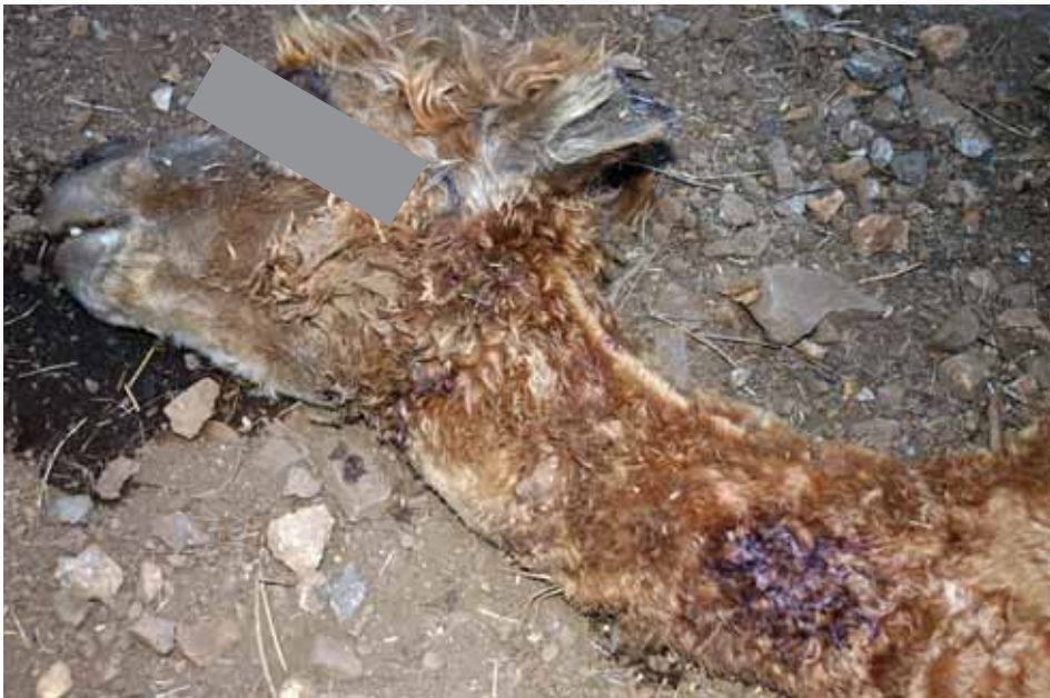
This alpaca was victim of a mountain lion attack. Note the mountain lion trademark bite (round in shape) to the neck. In this case the alpaca's ear was also torn. Most of the alpacas suffered only one bite to the neck. This attack resulted in five victimized alpacas and only one was partially eaten. Mountain lions sometimes kill over and over again as rapidly as they can, when they attack livestock in a fenced area. Wild life biologists call the phenomenon surplus-killing. The worst case on record is the loss of 192 sheep in a single night.

been a few well-publicized incidents involving mountain lions killing people since 1986, but the odds of this happening to you rate far below the odds of succumbing to a bee sting, lightning strike, snake bite, drowning or dog attack. From 1991 to 2003 the average death rate per year in California was .2. With Canada and the rest of the US added to this statistic the number of deaths to humans rises to about 0.8. Still an extremely rare occurrence, considering the number of people frequenting mountain lion habitats. In California