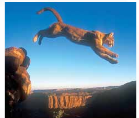
Mountain lions are amongst the most athletic cats in the world. They can leap 20 feet vertically and can clear 30 feet on a horizontal surface. They have the agility of a small cat and the strength of a leopard. They are a stealth predator preferring stalking cover to get close to their prey before leaping on it. Though most mountain lions leave livestock alone, some seek out livestock. There are approximately 10,000 mountain lions living in Oregon and California and many healthy populations in much of Canada and west of the Mississippi River in the U.S.

A man who once owned a mountain lion thought an eight to ten foot fence that angled out at the top two to three feet would keep a puma out. “They need to climb and if they bump into something at the top this should deter them.” Others thought double fencing with each fence height being six feet or higher might be an effective deterrent. This would create double barrier that interrupts stalking, throwing the puma off his game. Visual barriers were also suggested. It needs to be noted that none of these suggestions were seen as foolproof by the people suggesting them, nor did anyone want their suggestion attributed to them.