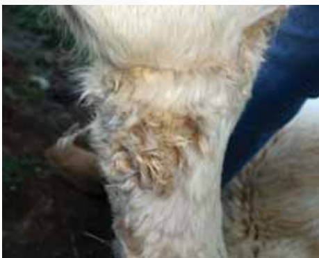
A telltale sign of cougar attack: a surgical-like bite to the upper neck

The animal control officer noted the fence was more than adequate, compared to most livestock operations in the area. The professionally installed five-foot high perimeter fence made of t-bar and heavy gauge no-climb wire, with a dog-proof base and reinforced gates had