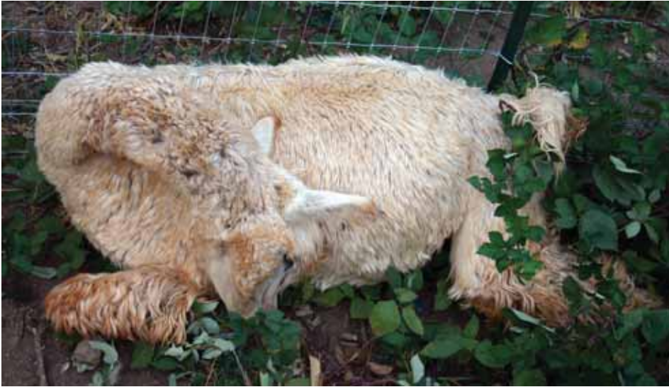
This is the alpaca who broke free the mountain lion's grip and ran from the site where the rest of her pasture mates were found killed. Unfortunately, she had been fatally wounded by a bite to her neck before she broke free. She had enough control in her final moments to kush along a fence with her tail flipped forward in final gesture of submission.

around chewing on an ear, and left the area without sampling it's other victims.