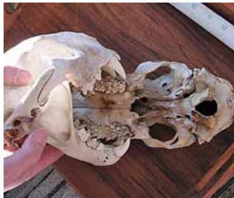
The tale of two skulls. A mountain lion skull is placed over a deer skull, showing how well a mountain lion's dentition is designed for a swift, powerful, and penetrating bite to the neck of its prey. The second skull in this photo is from a deer, the most common victim of a mountain lion attack.

Imagine a grid with one animal per square. When territories are occupied there is general stability in the system.