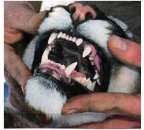
A mountain lion's mouth is well designed for both dispatching prey and eating meat. The large canines penetrate between neck vertebrae quickly killing the prey. The molars are sharp with scissor-like design for chewing meat. The mouth is round compared to a the long narrow muzzle characteristic of canine species. The round bite, with deep piercing wounds from the large spike-like canines, are indicative of a mountain lion.

Females and males go about their business, hunting, marking their territories and meeting up briefly to mate and produce the next generation. When adults holding territory are taken out of this system, instability occurs. It's like reshuffling a deck of cards. New cats fill the territories.