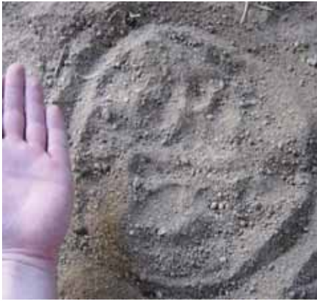
This footprint was found in the barn in the catch area where most of the alpacas were killed. This mountain lion was unusually bold to enter a doorway into an enclosed structure. The foot print is more than 4 inches across indicating a large mountain lion did the killing.