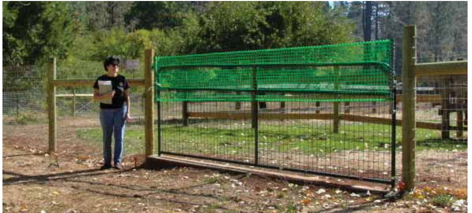
The five-foot no-climb fence around the pasture where five alpacas were killed was carefully constructed to keep out dogs and coyotes. The gates were modified to be the height of the fence and cement strips were poured under each gate to prevent a predator from pushing under a gate. The base on the entire perimeter had been reinforced with two strands of barbed wire. The animal control officer responding to the mountain lion attack noted that "the fence was more than adequate," but a mountain lion can jump a six-foot fence while carrying an animal in it's mouth. Mountains are capable of jumping twenty feet horizontally or vertically.

idiosyncratic mountain lion behavior usually involves sheep or goats – and now alpacas. Dog packs also have been known to indulge in surplus killing.