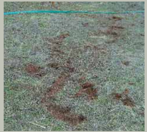
The ground around most of the slain alpacas was barely disturbed, indicating the cat was fast and efficient in running down its victims. However, the ground in this picture tells of a violent struggle by an alpaca that fought off its attacker. There are more than twenty deep gouges in the soil made up of mountain lion and alpaca footprints.

There was one notable exception. Judging by the paw prints and ground clearly disturbed by an alpaca's distinct cloven hooves, the predator and victim had struggled violently. This alpaca had fought loose and run quite a distance from the mayhem. As far as the cat knew this is the one that got away. In the